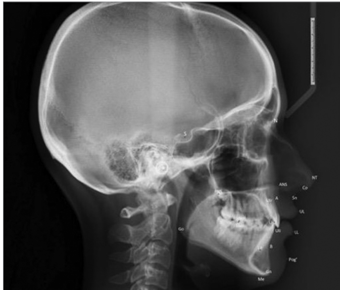
Figure 1. Cephalometric landmarks used in the study S: sella; N: nasion; Co: condyion; ANS: anterior nasal spine; PNS: posterior nasal spine; NT: tip of nose; Go: gonion; Me: menton; Gn: gnathion; B: B point; Pog': Pogonion soft tissue; A: A point; U1r: upper incisor root; U1i: upper incisor incisal; L1r: lower incisor root; L1i: lower incisor incisal; U6O: upper first molar occlusal; L6O: lower first molar occlusal

Lateral cephalometry is an essential material to diagnose the anteroposterior and vertical discrepancies and to evaluate the relationship between soft tissue and dental structures (5). Developments in technology have led to the rising use of digital cephalometric analysis systems, which have several advantages: radiation doses are reduced, data storage is improved, and images are easily manipulated (6). Regardless of whether the chosen